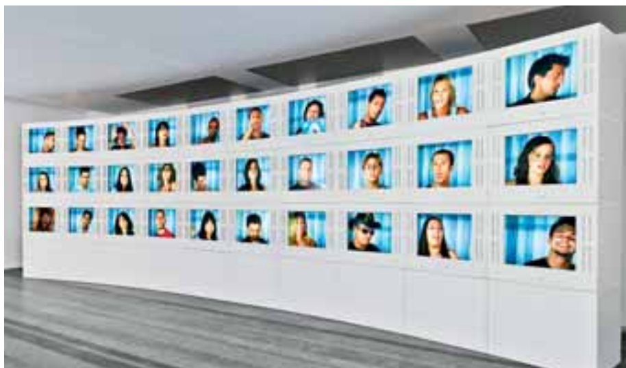
Candice Breitz, Queen (A Portrait of Madonna) , 2005. 30-channel installation, 73 min 30 sec. Courtesy of the work: Kaufmann Repetto (Milan) + White Cube (London)