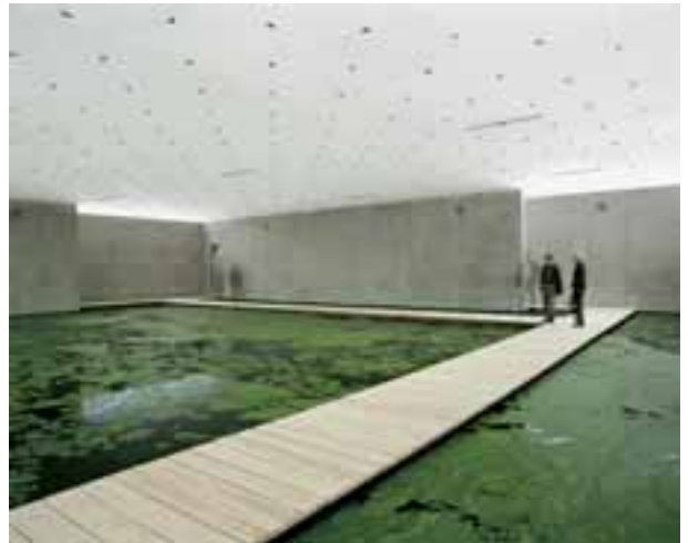
Olafur Eliasson, The mediated motion , 2001. In cooperation with Günther Vogt. Installation view at Kunsthaus Bregenz, 2001.