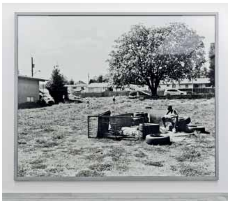
Jeff Wall, War Game , 2007, gelatin silver print