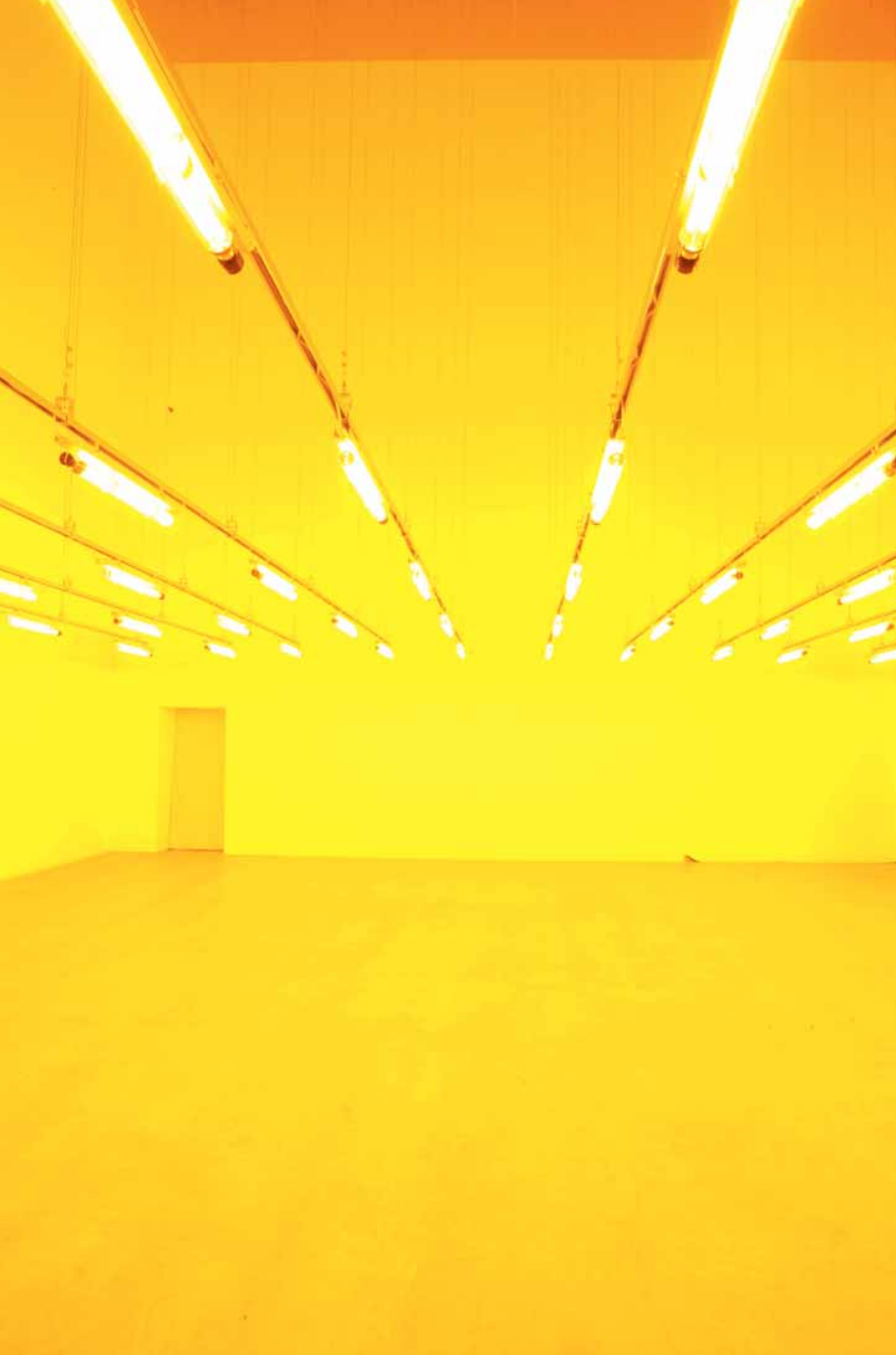
Olafur Eliasson, Room for one colour , 1997. Installation view at 21st Century Museum of Contemporary Art, Kanazawa, 2009–2010.