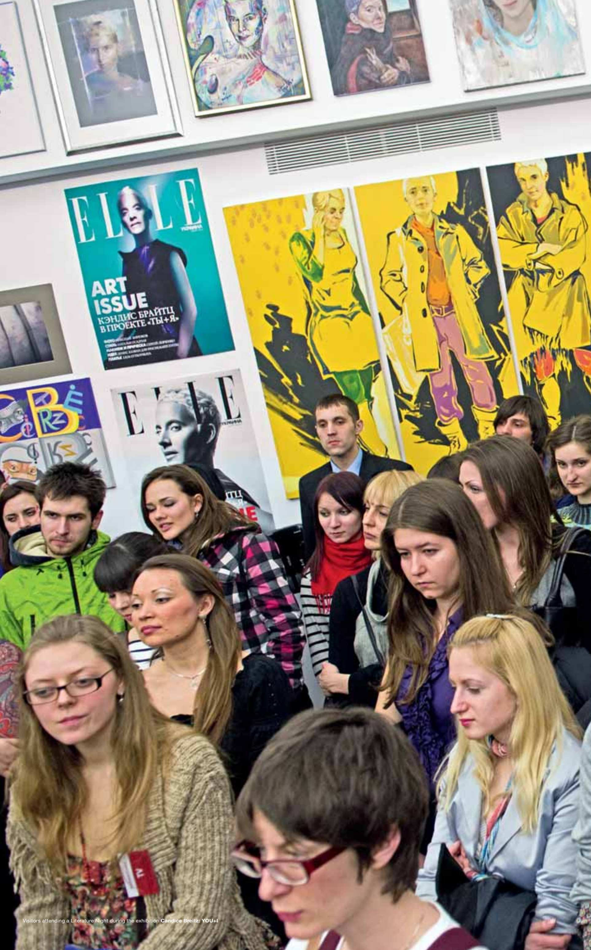
Visitors attending a Literature Night during the exhibition Candice Breitz: YOU+I