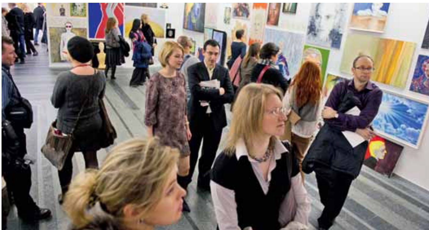
Guests at the vernissage of the exhibition Candice Breitz: YOU+I

Candice Breitz: The new season in the art centre presents four projects at once, two of them are the solo exhibitions of Candice Breitz, a South African artist with a Berlin residence, and Mexican artist Damián Ortega. For the project You+I Candice Breitz gathers materials for a large group self-portrait, discovering ways of portraiture in contemporary Ukraine. Very interesting are those works by Breitz which show you some unexpected details about famous people. An example is the multi-channel video Queen where two dozen people simultaneously sing Madonna's hits – an excellent occasion to reflect on the relationship of pop music and Baptist church hymns. Kommersant , Ukraine, 17.02.2011