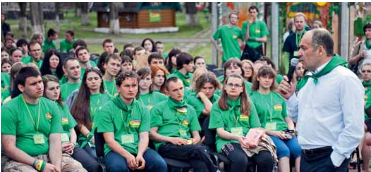
Annual Forum of the Zavtra.ua scholarship program. Award Ceremony: Victor Pinchuk addressing the scholarship holders