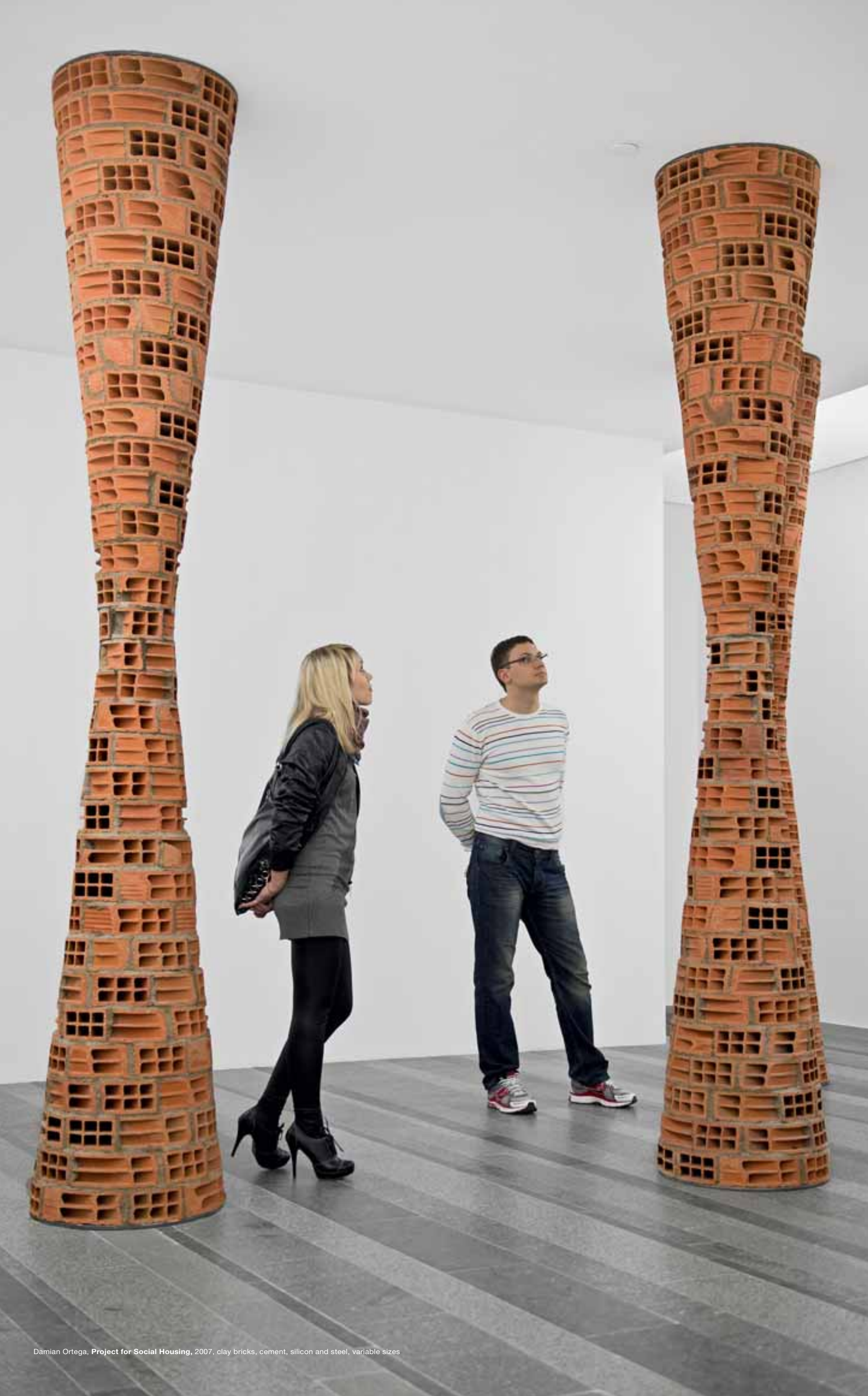
Damian Ortega, Project for Social Housing , 2007, clay bricks, cement, silicon and steel, variable sizes