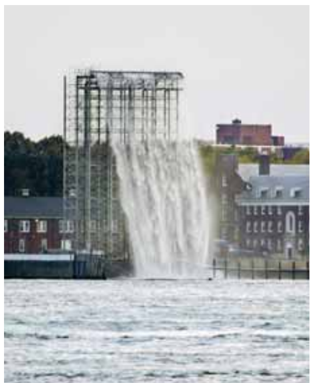
Olafur Eliasson, The New York City Waterfalls , 2008.