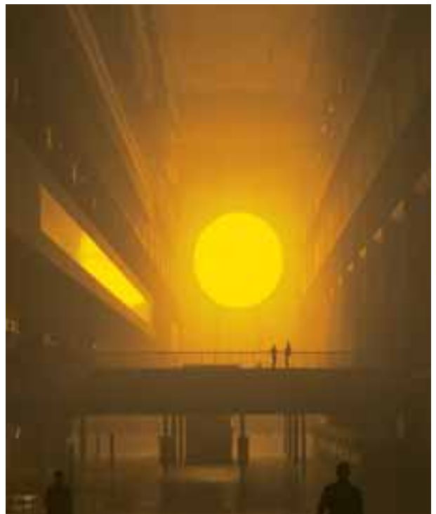
Olafur Eliasson, The weather project , 2003. Installation view at Tate Modern, London, 2003.