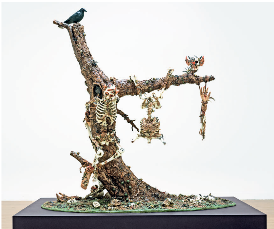
SEX I , 2003, painted bronze, 246 x 244 x 125 cm. (left)