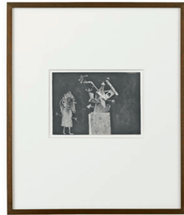
From the series HUMAN RAINBOW , 2011, 38 hand-coloured etchings, each 47.5 x 40 x 2.5 cm framed.

The PinchukArtCentre now presents the sequel to these works, The Sum of All Evil (2013). This new, monumental miniature landscape originates from the historical events that took place in 1941 in Babi Yar, the site of a Ukrainian mass grave where Nazi occupiers executed 34,000 Jews in just two days. The work also alludes to such