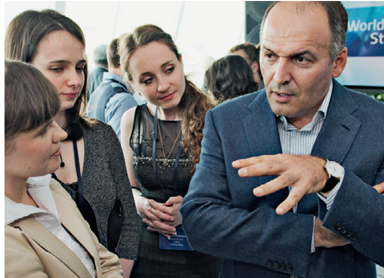
Victor Pinchuk with the recipients of the WORLDWIDESTUDIES SCHOLARSHIP

The projects of the Victor Pinchuk Foundation include, among others, the network of neonatal centres Cradles of Hope, the largest private scholarship programme in Ukraine, Zavtra.UA, the World-WideStudies scholarship programme for Ukrainian students studying abroad, the centre for contemporary art PinchukArtCentre with its biannual prizes Future Generation Art Prize and PinchukArtCentre Prize, the Davos Philanthropic Roundtable and Davos Ukrainian Lunch organized each year at the occasion of the Annual Meeting of the World Economic Forum, the international network YES (Yalta European Strategy) to support Ukraine's European integration, and an online platform for fostering philanthropy, the Philanthropic Marketplace. The Foundation is a member of the European Foundation Centre and the Ukrainian Grantmakers