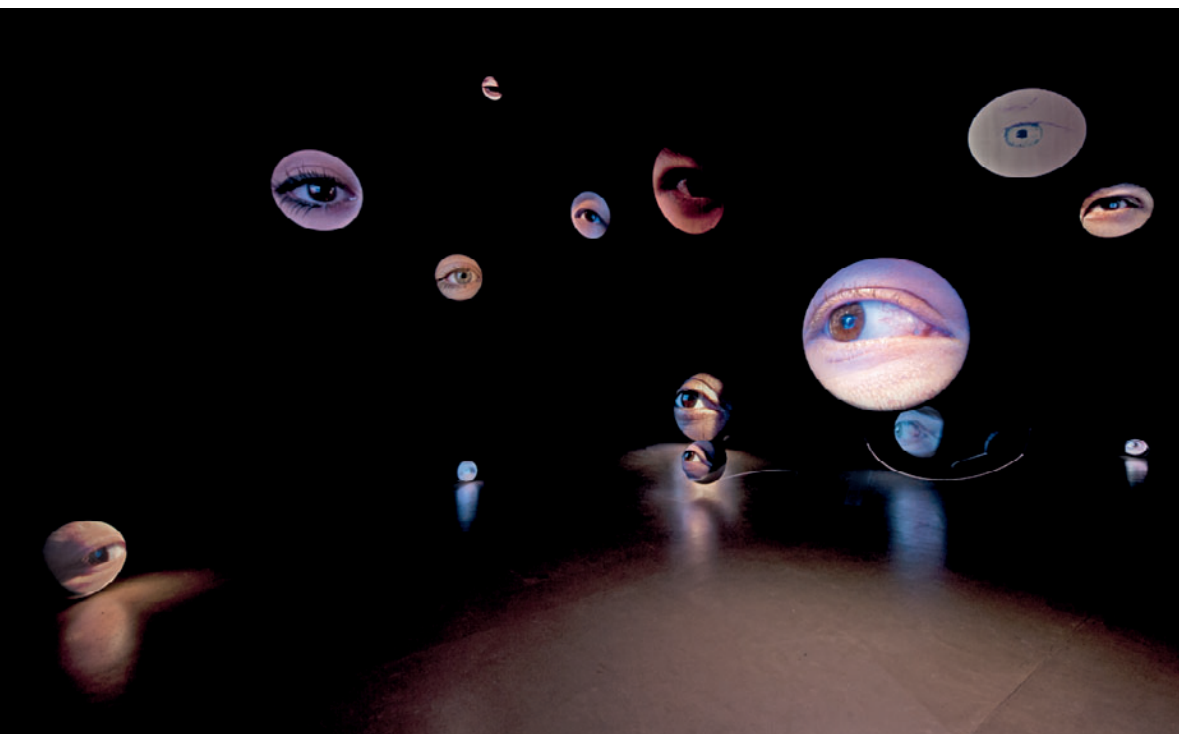
EYES , 1996, video projection, foam, resin, fibreglass, acrylic, sound, dimensions variable. Installation view ARoS Kunstmuseum, Aarhus 2012

Oursler also explores the interaction between sculpture and spectator. He is aiming for a conversational structure in which the object not only speaks but also provokes the viewer's imagination. Oursler says: "This open conver-