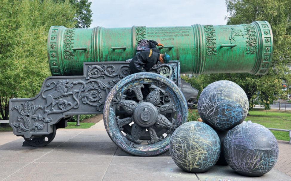
BIG GUN , 2012, performance, Donetsk, with the support of Foundation Izolyatsia.

consequences. This starting point in is transformed into a wider range of meanings – problems of interaction, assimilation, desolation, to name just a few. What is your personal commitment to that phenomenon?